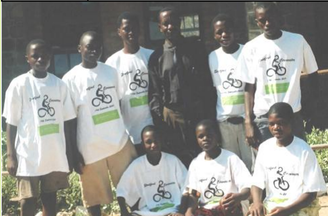
Yofu pupils wearing Needham and James sponsored bike ride t-shirts:

We look forward to the return of St Edward's School Oxford to Likoma for their school community project in July 2010!